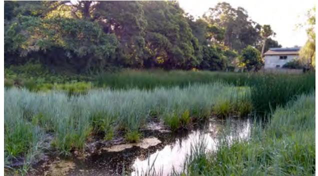
Jessie Street Marsh

Project is funded by Wastewater and a portion from the Santa Cruz County Sanitation District.